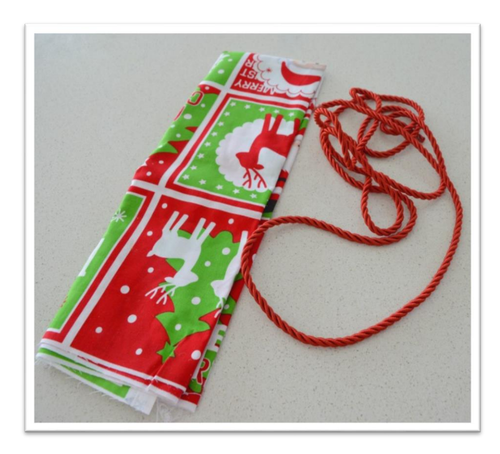
PLEASE NOTE: You can use two pieces of fabric instead of one piece folded over.