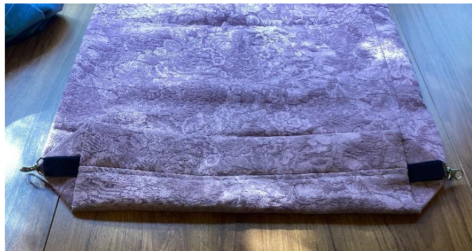
The lanyard hooks attached to the base of the bags.